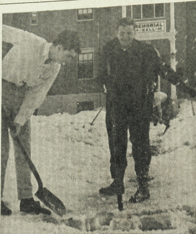
I'm sure I lost that DIME along here.

Tomorrow Katharsis will be available for sale and launched by a (gala?) reception. Pick up your copy for only a dollar. Although we have not even scanned the contents we are assured of high quality by a glance at the names of those who have labored to make the work a reality.