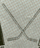
FRANCIS MCINTYRE TRAINER