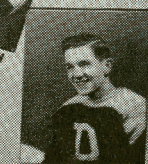
ELMER BLANCHARD CENTRE