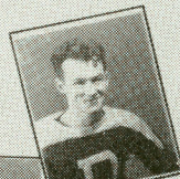
JACQUES THIBEAULT CENTRE