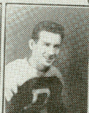
REGINALD RODGERS CENTRE