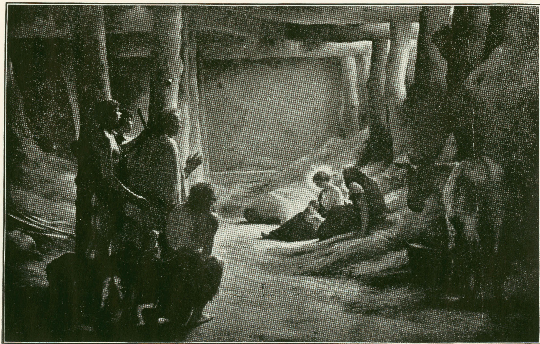
"Gloria in Excelsis Deo"