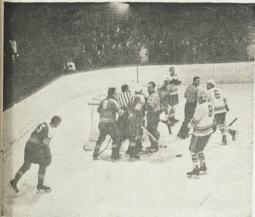
SPORTS PLAYED A PROMINENT part in the three days of festivity. The Varsity Saints added to the Carnival spirit by fighting (above) to their fifth consecutive victory. The contest was a prelude to the all-important St. F. X. game two days later.