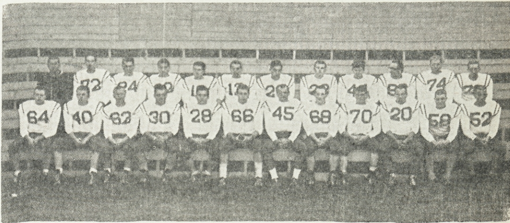
Staunch Varsity team before battle with UNB.

Once again the Red and White forces from St. Dunstan's University return to the football wars — this year against rough, classy competition in the "A" Conference of the Maritime Intercollegiate Football League. Previous to this issue of Red and White, the Hilton men engaged the University of New Brunswick at Fredericton.