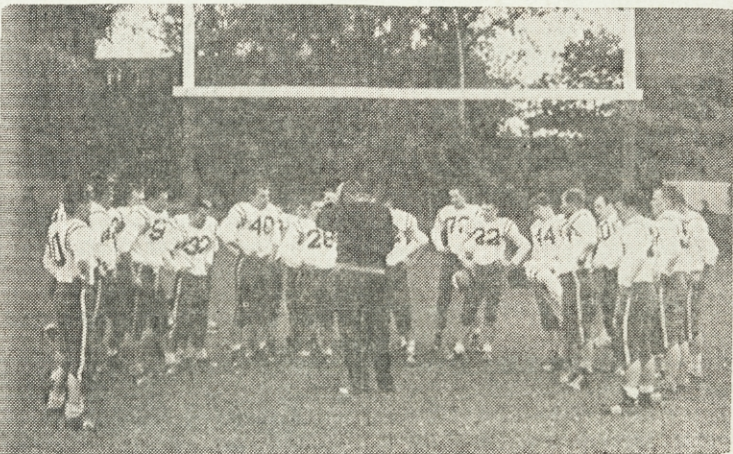
"Now let's see! What was that other play?"

These returnees along with other newcomers should hold their own against the bigger schools in the "A" conference.