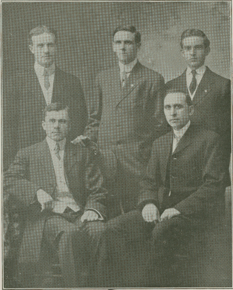
FIRST EDITORIAL STAFF OF RED AND WHITE, 1905