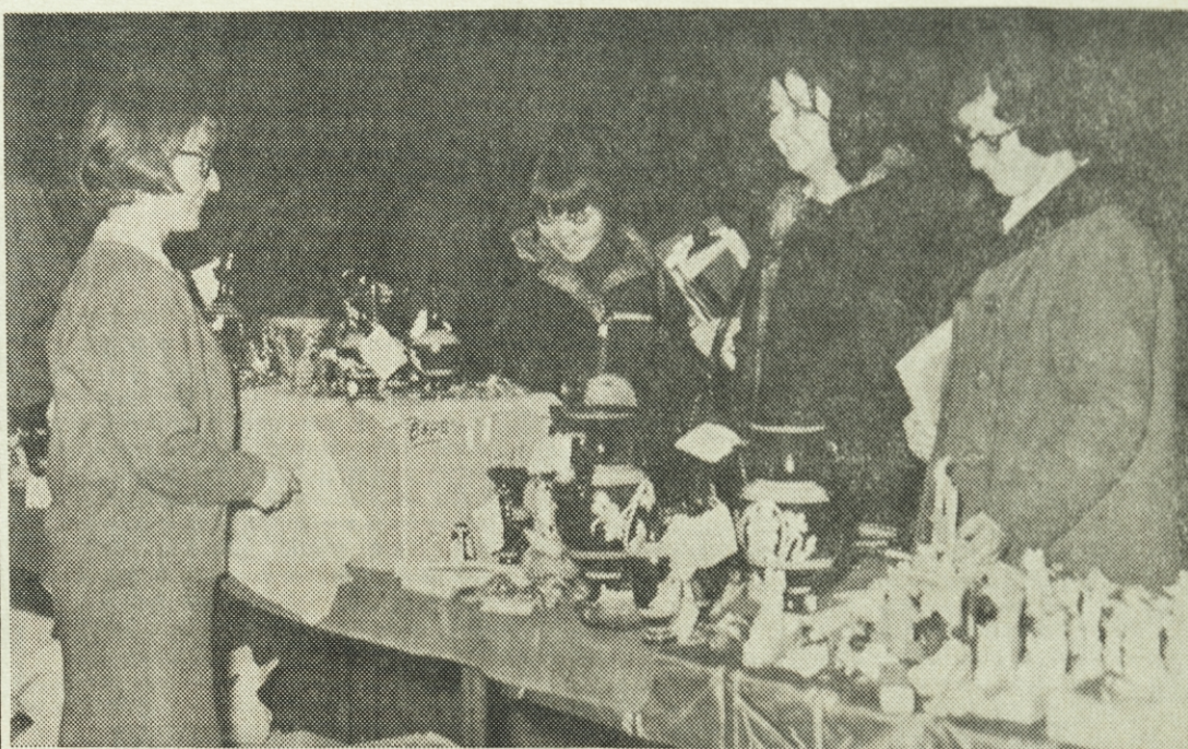
A late rush of enthusiastic buyers made this year's two-day stand of the Treasure Van an even greater success than last year.

200 POWNAL STREET, P.O. BOX 519, CHARLOTTETOWN